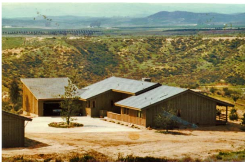
Our first home in Temecula, on the grapefruit grove in Glenoak Hills.