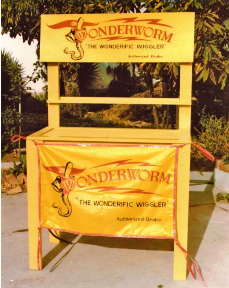
One of the point of sale Wonder Worm display boxes that we placed in bait shops throughout Southern California.