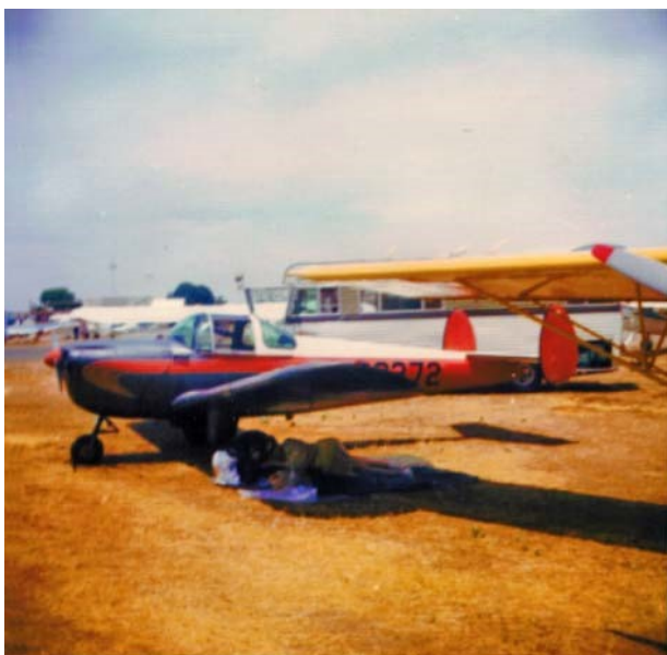
Our Ercoupe plane taken at Porterville. Virginia is lying under the wing.