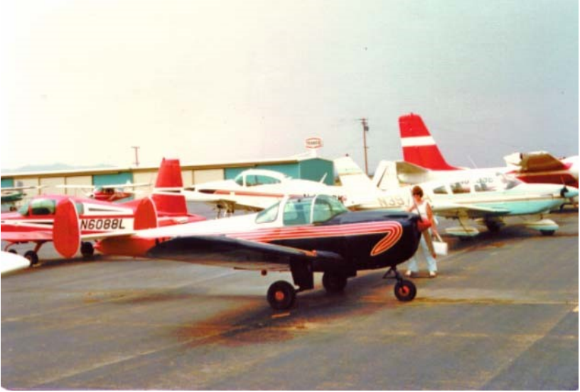
Evelyn with our Ercoupe plane at the Palm Springs Airport.