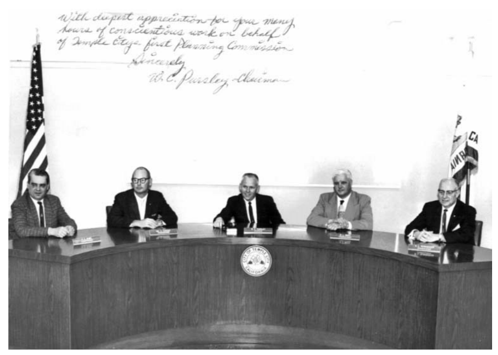
That's me, second from left as a member of Temple City's first Planning Commission. I later served as Chairman of the Commission.