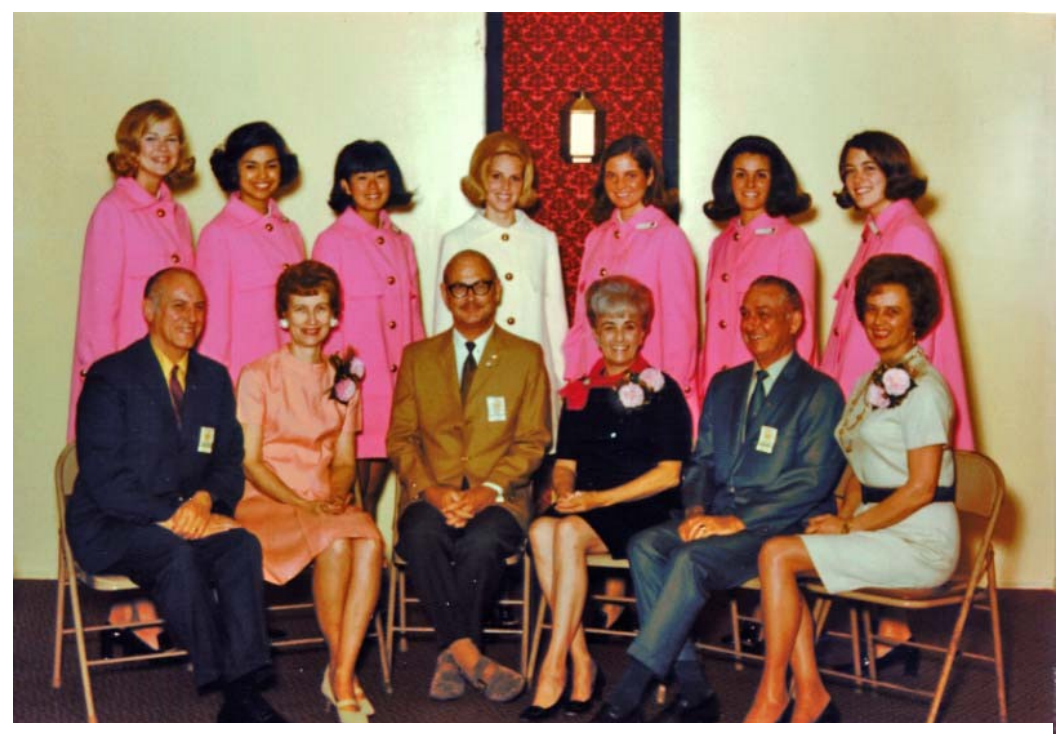
Virginia and me with the Tournament of Roses Royal Court in 1967. We are in front row center of the group.