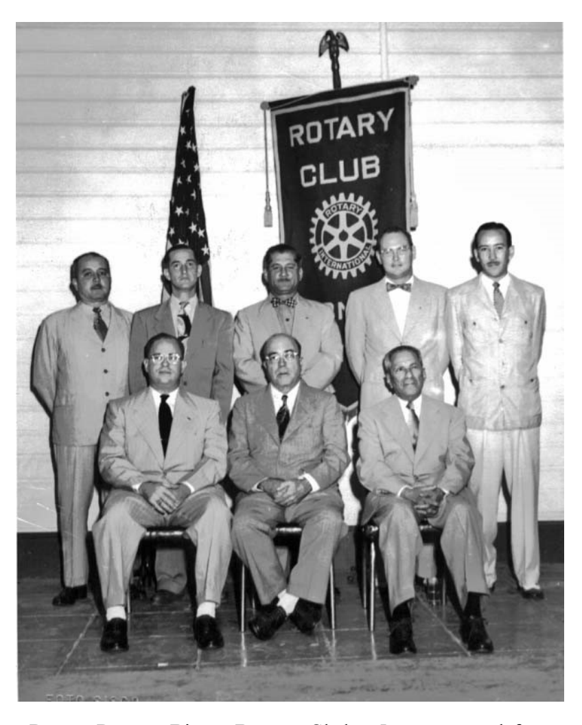
Ponce Puerto Rican Rotary Club. I am second from right standing in back row. I later became President of the club.