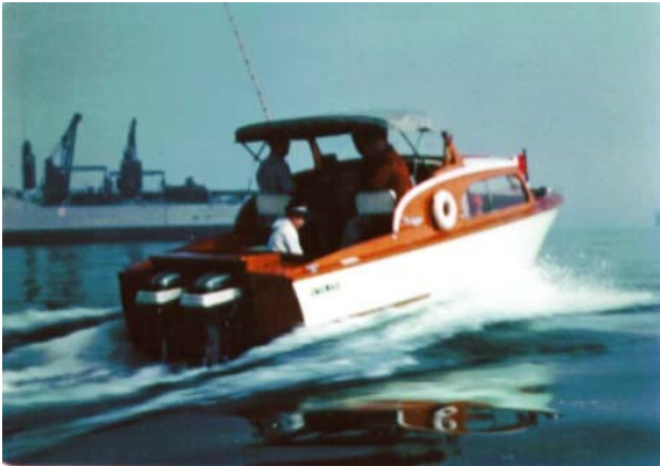
Full speed ahead in the Umgwadi.