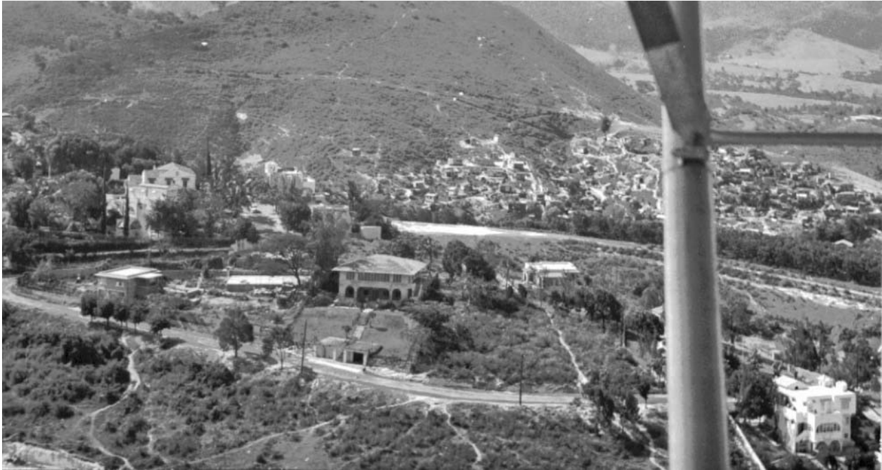
Aerial view of the Trolley House on El Vigia, one of our homes in Puerto Rico. It is the two story building in the lower left center. You can see the garages built into the side of the hill below the house.