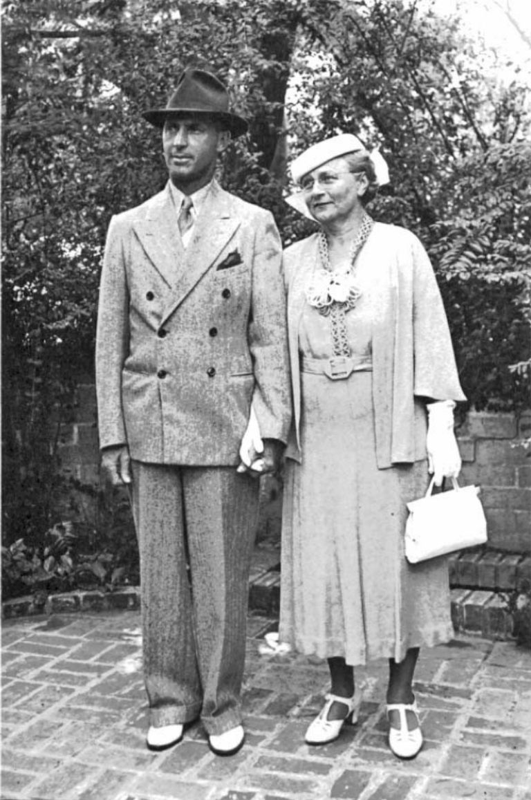
My dad and mother taken about 1935. The used bricks they are standing on came from the ruins of the old Ramona Grammar School.