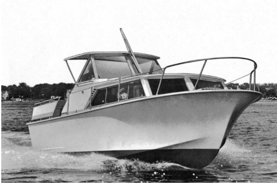
Our last boat, the Caledonia.