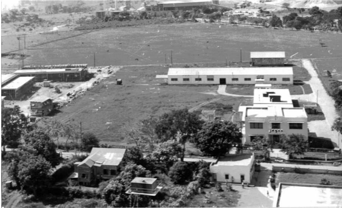
Aerial view of the Joyce Shoe plant in Ponce, Puerto Rico. The plant consisted of the two white buildings to the right.