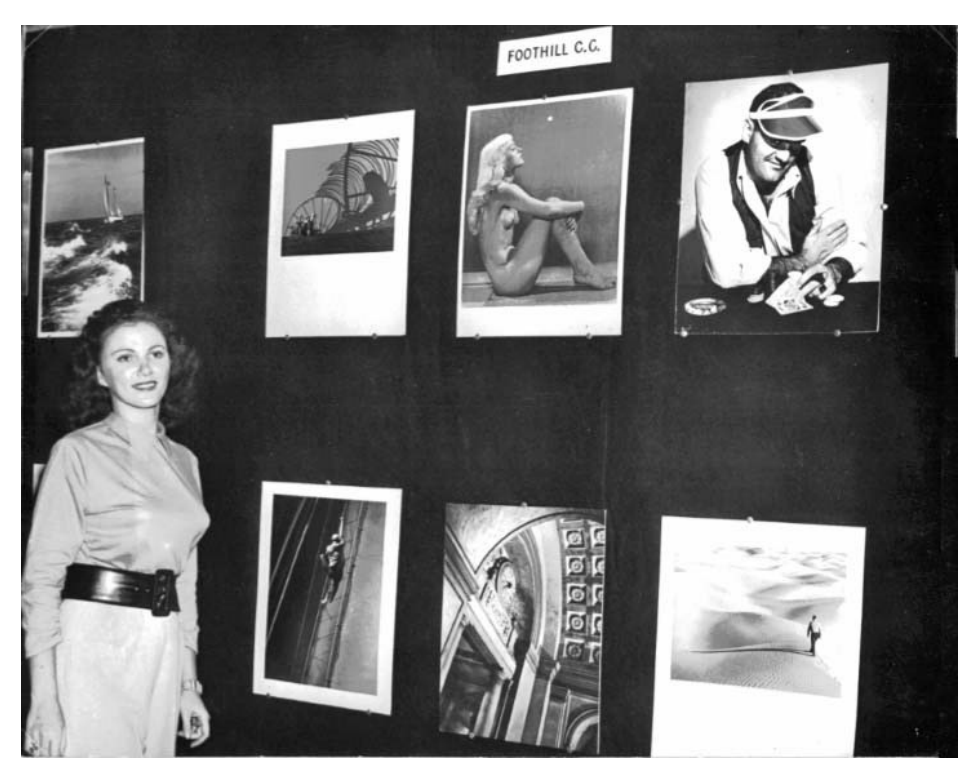
Foothill Camera Club exhibit. Second photo from left in top row is one of mine.