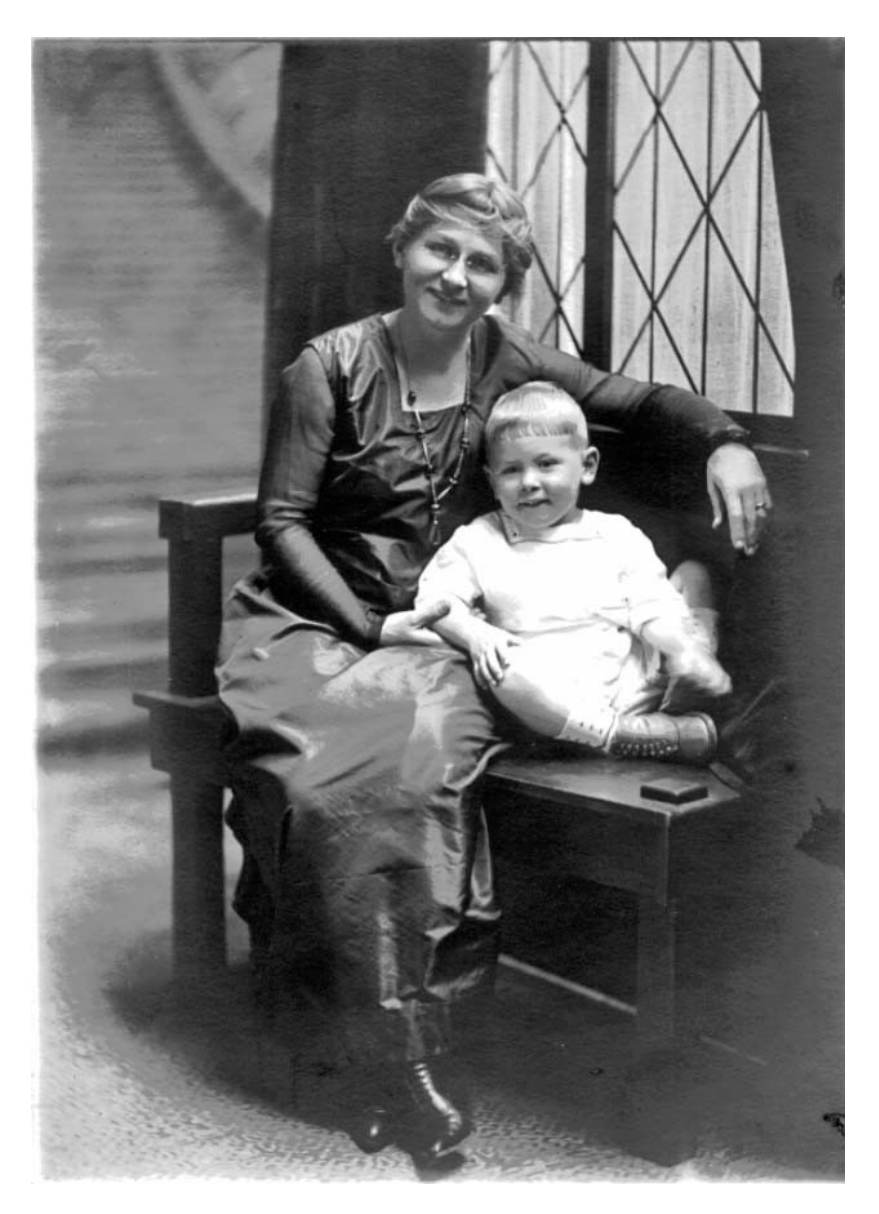
Mother was really proud of her little boy.