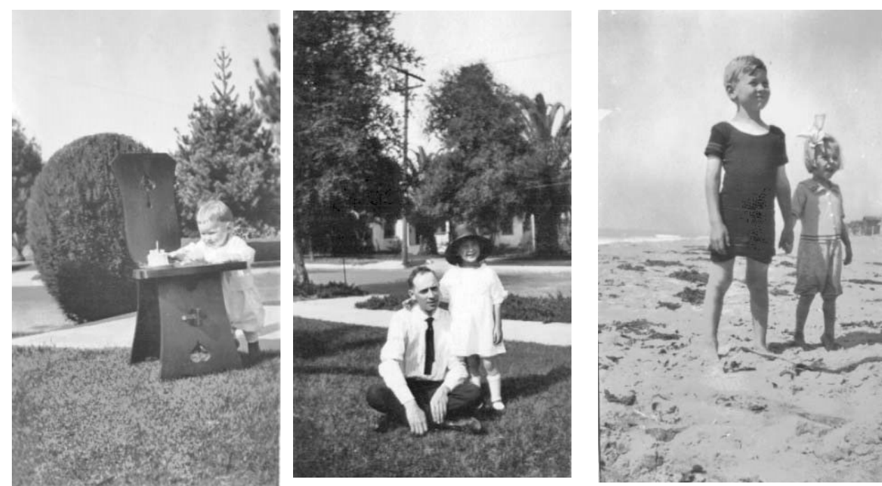
Me with my first birthday cake.