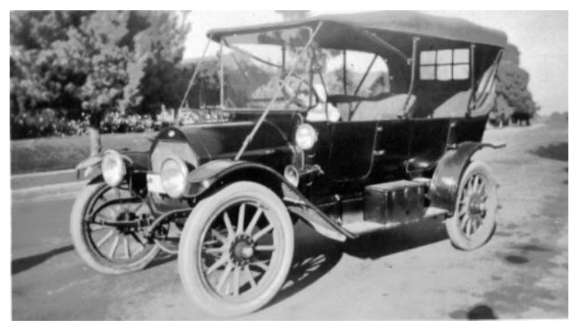
My parents' second car, a Buick.