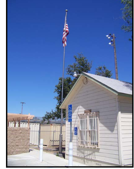
The Historic Hunt is the proposed future home of the Murrieta History Museum. Photo by Jeffery Harmon

This plaque, mounted on a rock monument, is located at the northwest corner of the park behind the white perimeter fence. Photo by Jeffery Harmon