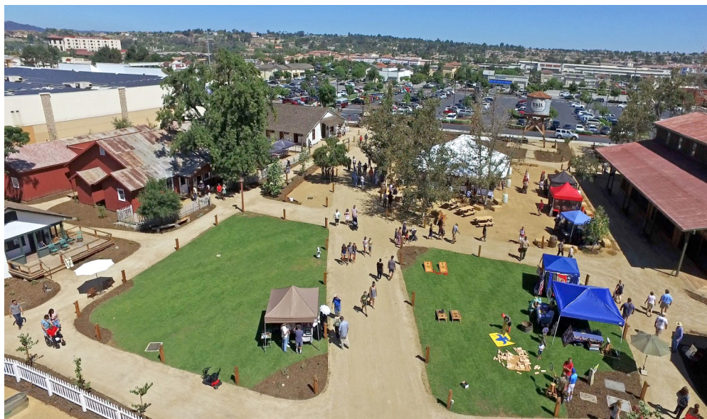
Drone view on Ribbon Cutting Opening Day. What a joyous and proud day for VaRRA.